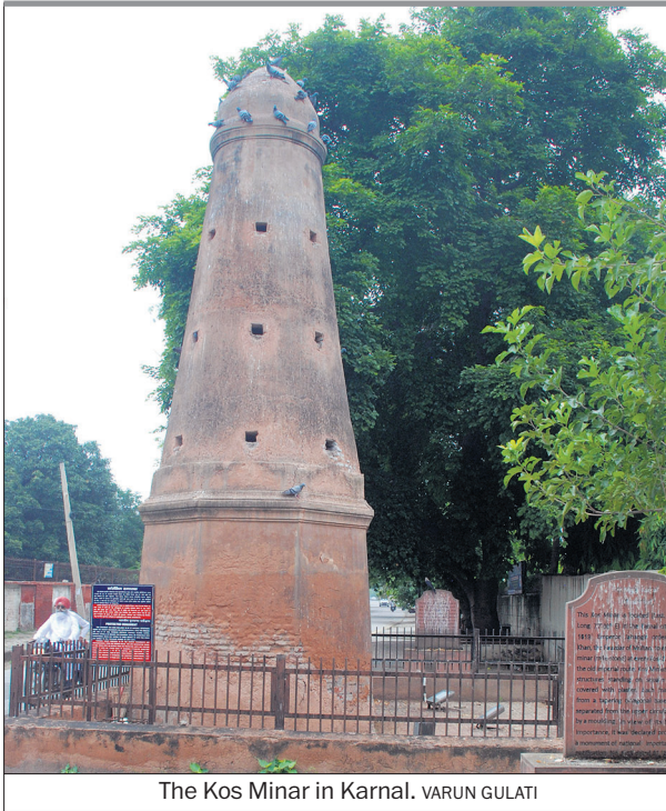
The Kos Minar in Karnal.

The study was carried out in coordination with the