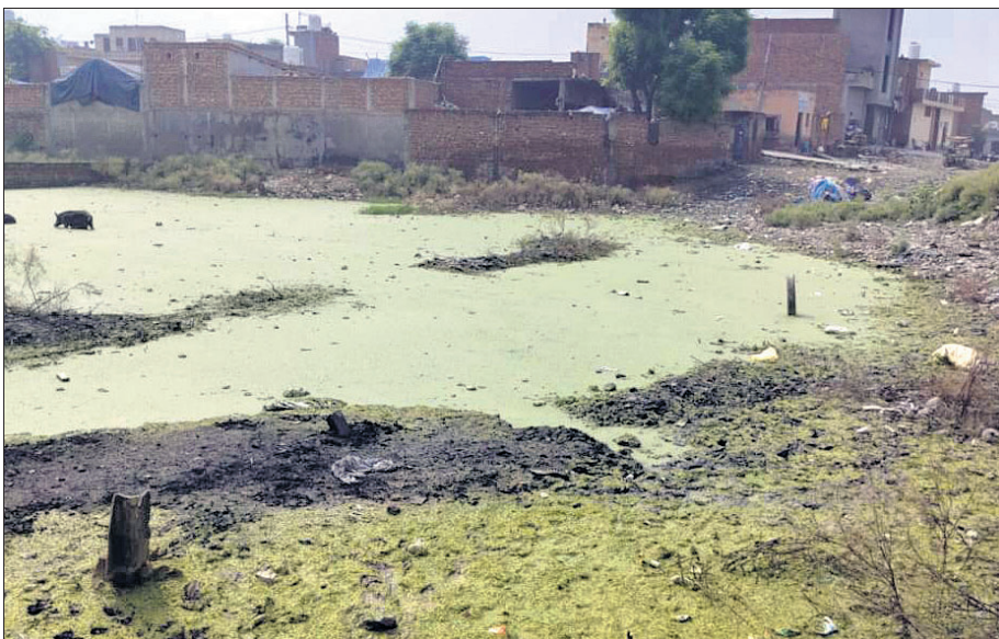
The waterlogged area adjoining the IOCL pipeline in Panipat.